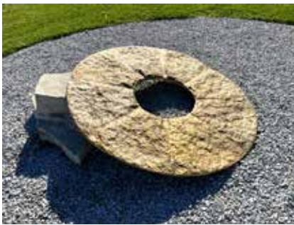
"The Circle of Gold, Destruction and Renewal", 2012; bronze, 70 inches