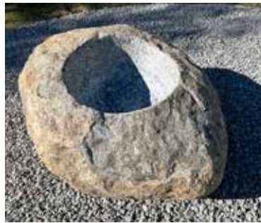
"Earth, the Blue Stone", 2012; Blue Bahia granite, 24x38x53 inches